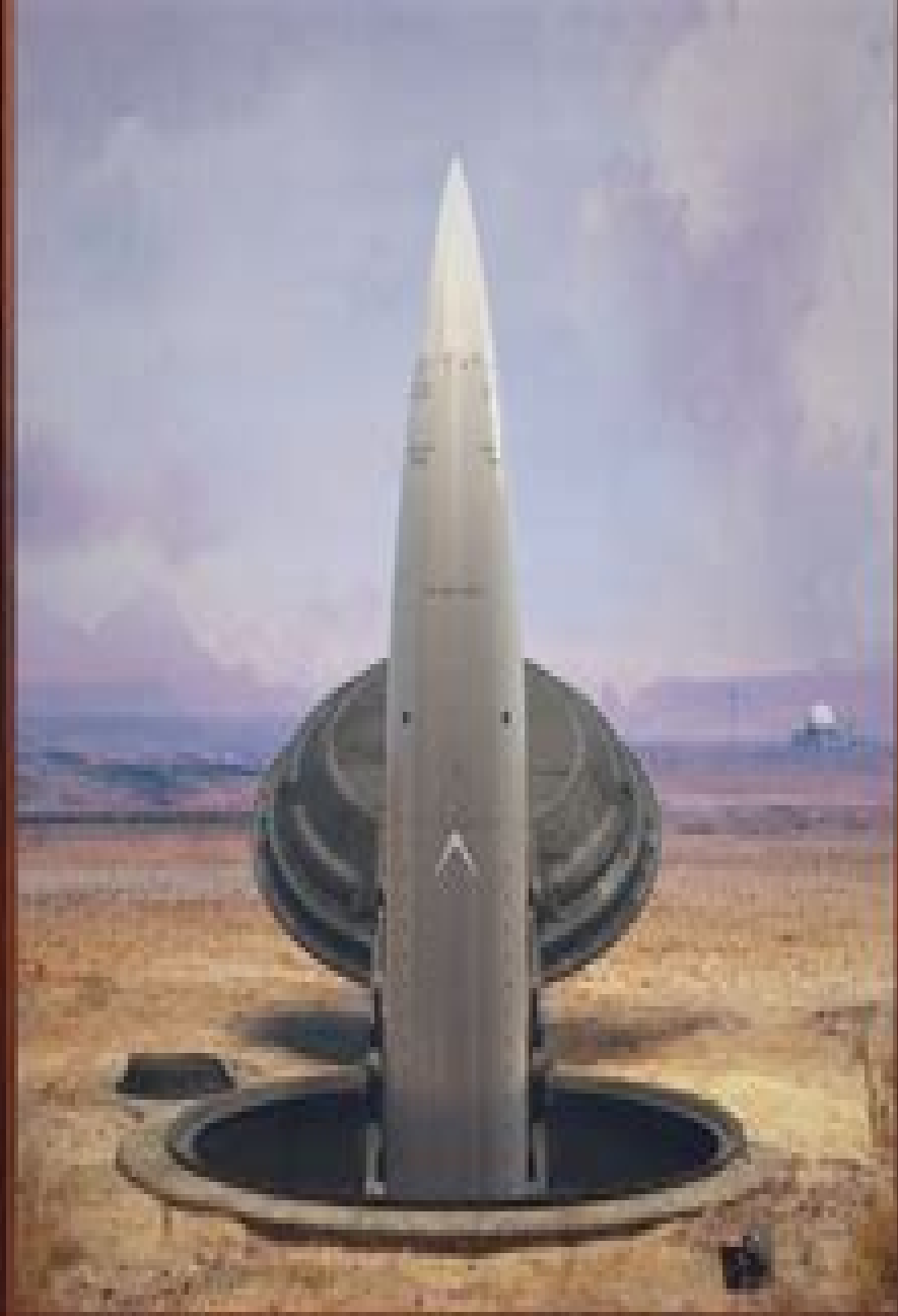
"THE ATOMIC ACT"