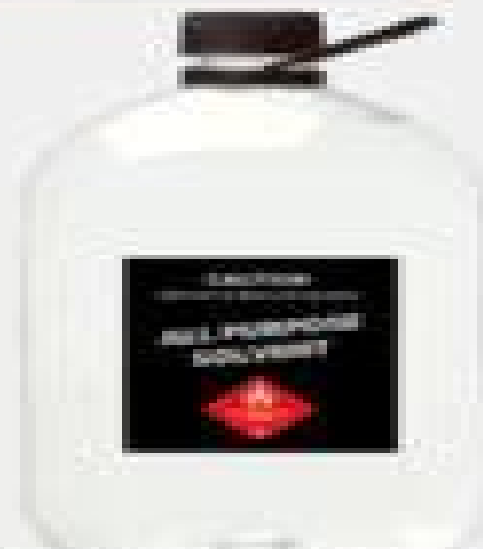
Solvents carry the paint from the container to the substrate, and they also help to improve the appearance of the paint.

For example, today's trend is towards lower viscosity to reduce time required from the application when something is being done to reduced wet edge and the appearance of excessive brushstrokes and "orange-peeling" like appearance of a dried edge around the perimeter of a wall where the thickness of the paint coating, the roller applied technique.