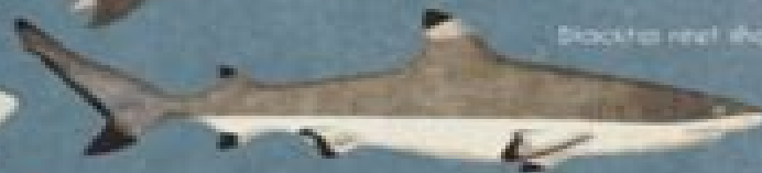
Blacktip reef shark