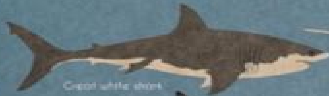
Great white shark