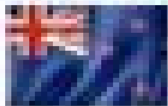
NEW ZEALAND FLAG