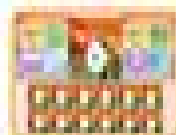
Year 4 Maths Meeting: Number Place

Year 4 Maths Meetings are provided as a guide for what you could include in a series of Maths, reasoning and problem-solving sessions. Materials included in this document are skills as well as problem-solving ideas throughout the year.