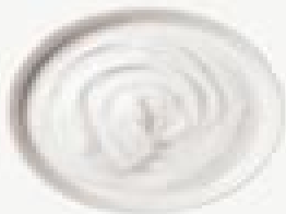
Greek yogurt (non-fat) - 69%