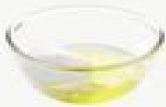
egg whites - 84%