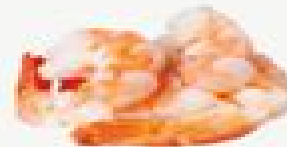
shrimp/prawns - 77%