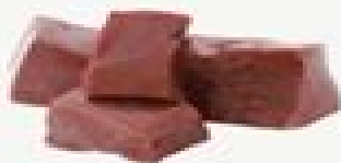
liver - 61%