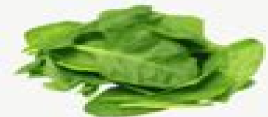
spinach - 52%