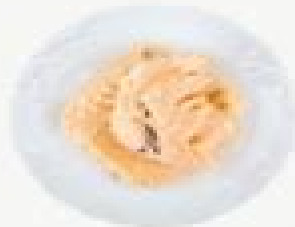
salmon (canned) - 67%