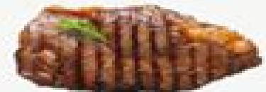
sirloin steak - 75%