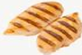
chicken breast - 81%