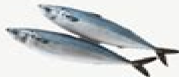
mackerel - 59%