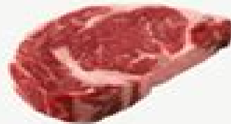
ribeye (fat trimmed) - 63%