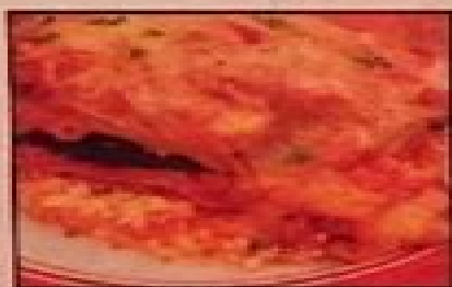
★ Chicken Lasagna