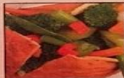
★★★ Oriental Stuffed Potato

Why fuss with calorie counts? Let The Lose Weight Naturally Cookbook do it for you! The three-star Weight Loss recipes—those lowest in calories—are the all natural, fresh and nutritious dishes you're bound to love eating when you start out on your weight-loss quest. As you reach your goal and even retain it, you'll want to switch to the two-star Maintenance dishes—those slightly