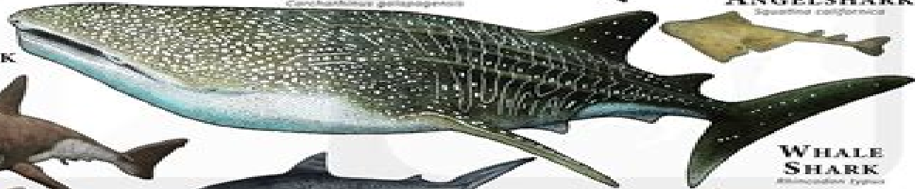
WHALE SHARK Balaenodon typus