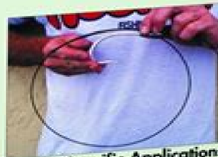
Species Specific Applications

Learn How to Rig Balleyhoo, Mullet & Mackerel to Catch Big Game Fish