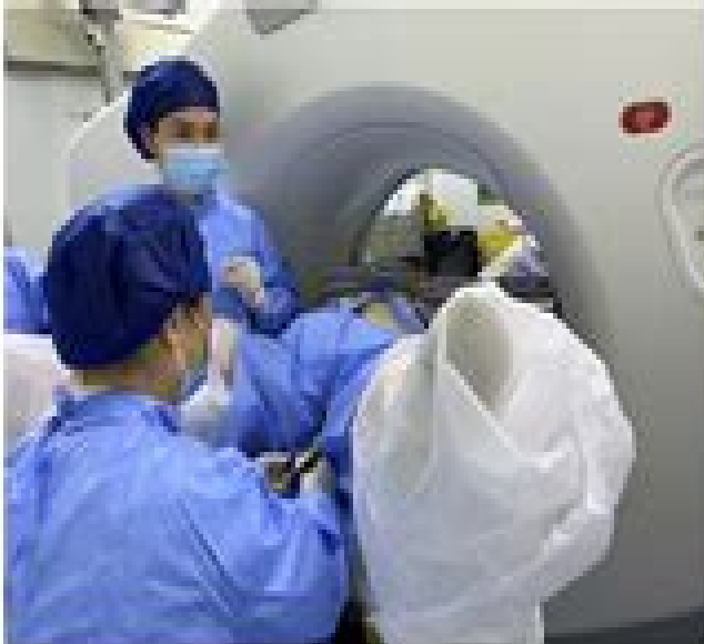
Image guided implantation