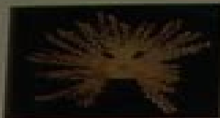
Golden Sunburst, 1960s