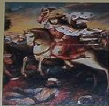
Warrior on Horseback, 1960s, Museum