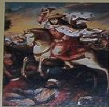
Warrior on Horseback, 1980, D. C. A. B. 1980