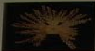
Sunburst, 1980, D. C. A. B. 1980