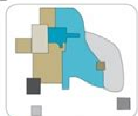
Multiple nuclei model

Land use is arranged in wedges or sectors which radiate from the city centre. Growth follows a linear pattern along major transport routes or physical features such as river valleys. We assume that once a particular type of land use establishes itself in an area, it attracts similar activities (like industry) and repels dissimilar ones (like high-status housing).