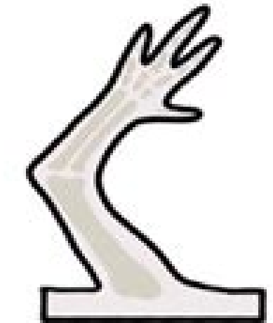
Re-differentiation and redevelopment