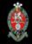
Princess of Wales's Royal Regiment