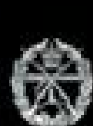
Small Arms School Corps