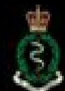
Royal Army Medical Corps