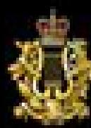
Corps of Army Music