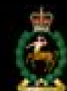
Royal Army Veterinary Corps