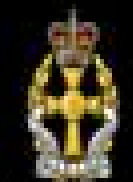
Queen Alexandra's Royal Army Nursing Corps