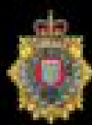
Royal Logistic Corps