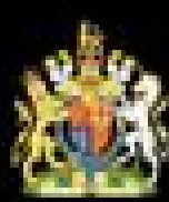
General Service Corps