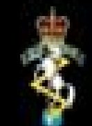
Royal Electrical & Mechanical Engineers