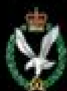
Army Air Corps