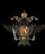
Queen's Dragoon Guards