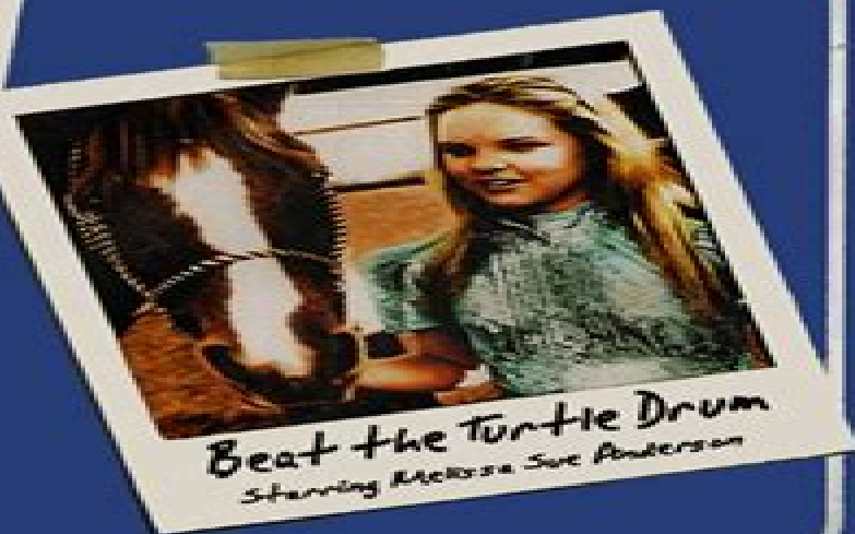
Beat the Turtle Drum Starring Melissa Sue Anderson