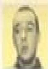
and Louis L'Amour?