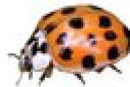
Asian lady Beetle