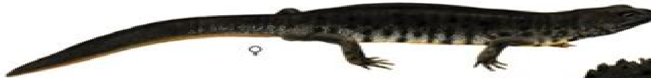
Great crested newt Triturus cristatus

All approximately life size unless otherwise indicated