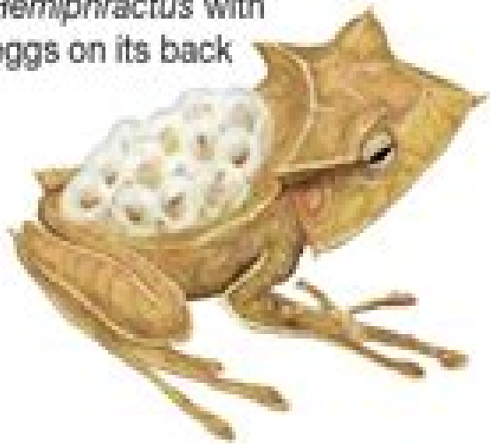
Hemiphractus with eggs on its back