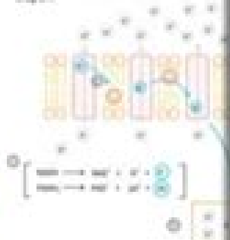
Diagram of oxidative phosphorylation