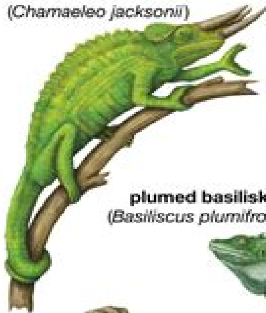
Jackson's chameleon ( Chamaeleo jacksonii )