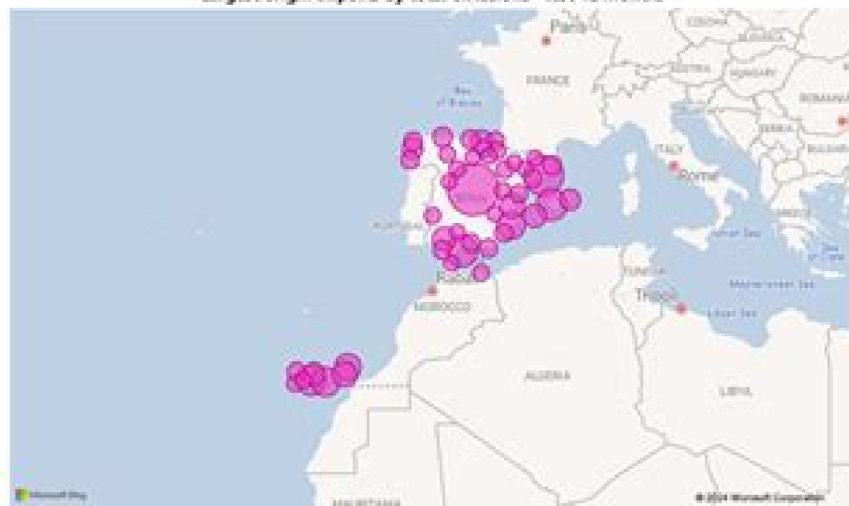
Largest origin airports by total emissions - last 12 months