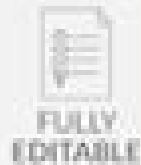
IMAGE NOT INCLUDED