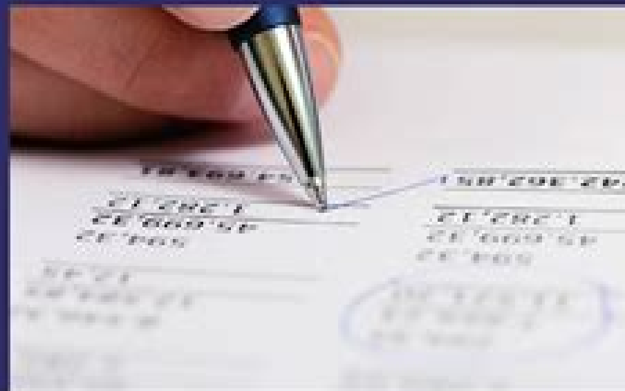
Applications of Monte Carlo method

Availability of multiprocessor computers, allows us to solve many complex problems using Monte Carlo method. Monte Carlo methods have been further developed to solve a variety of multidimensional integrals, linear and nonlinear boundary value problems. In monograph we used the deep connections between differential equations and random processes. This connection has been known long ago, the results of the theory of differential equations have been widely used in the theory of probability and vice versa. The solutions of large class linear and nonlinear equations of elliptic and parabolic type may be represented in the form of integrals over the trajectories of Markov process. In the current work we study the approaches connected with simple and branching Markov processes. We obtained effective unbiased estimators for the solutions. Constructed numerical algorithms are strict proved and used for the solution of problems of mathematical physics. This book meant for specialists of numerical methods who applied Monte Carlo methods for the solution boundary value problems, calculating multidimensional integrals and work in the area financial mathematics and statistics.