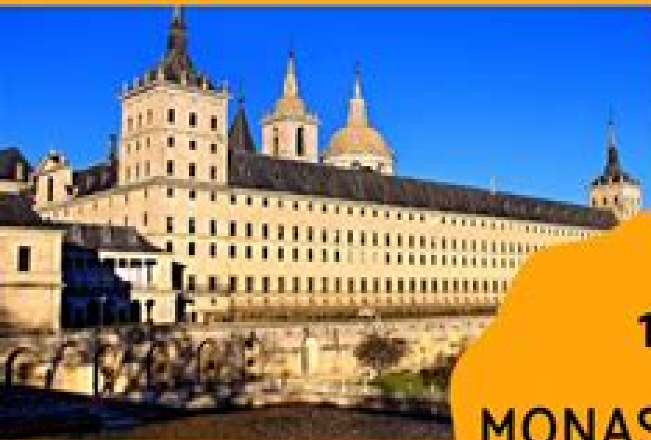
MONASTERIO DE EL ESCORIAL