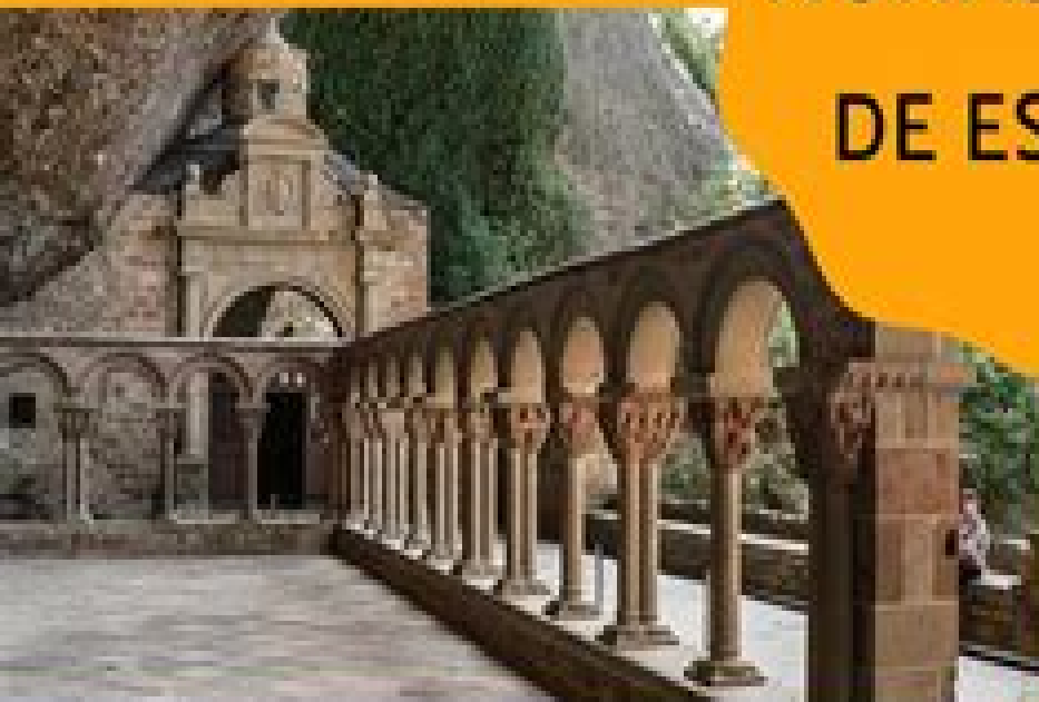
MONASTERIO DE SAN JUAN DE LA PEÑA