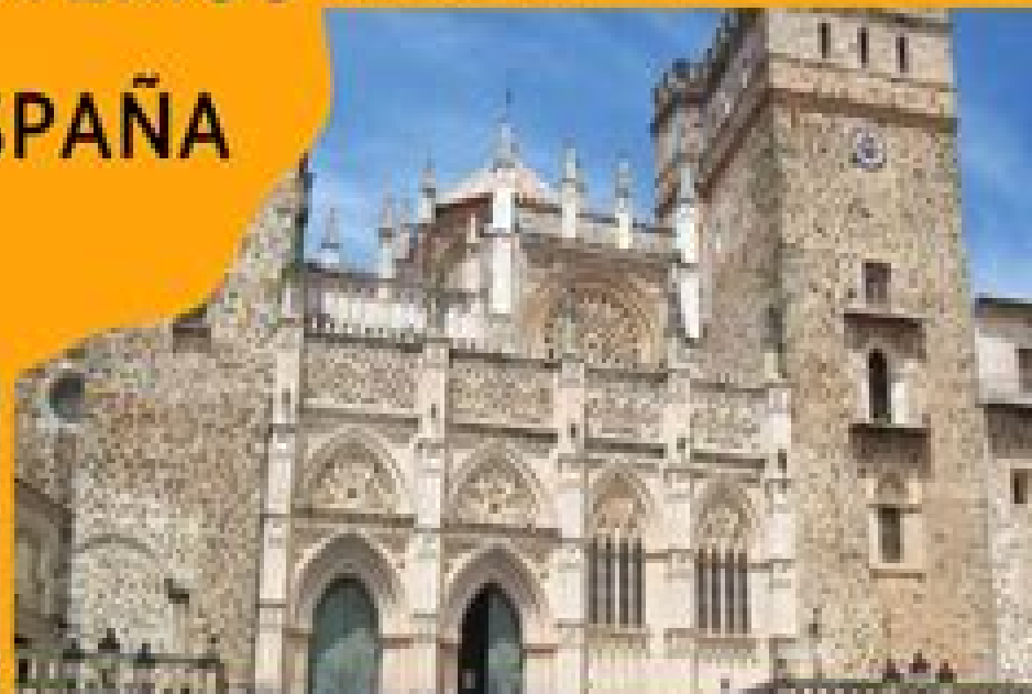
MONASTERIO DE GUADALUPE