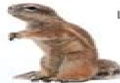
Arctic Ground Squirrel