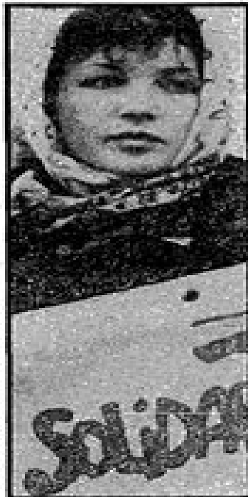
London protest . . . part of the Polish Embassy vigil

Speaking with "a heavy heart and agonised bitterness,"