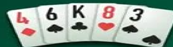
10 High Cards