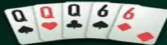
4 Full House