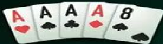
3 Four Of A Kind