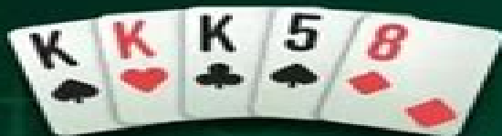
7 Three Of A Kind