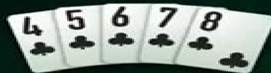
2 Straight Flush