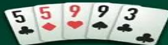
8 Two Pair