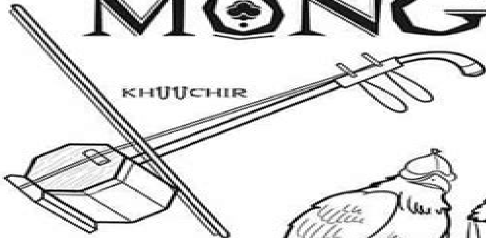
CHASSE A L'AIGLE