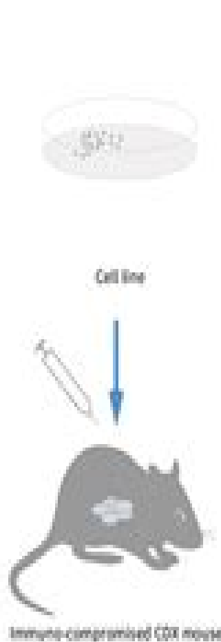
CDX (cell line derived xenograft)