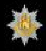
Royal Anglian Regiment