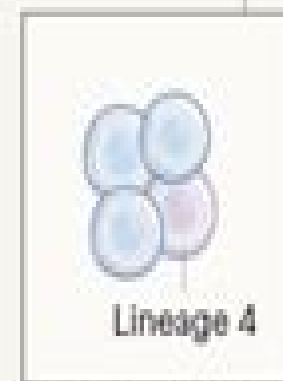
Tumour evolution tracked over time