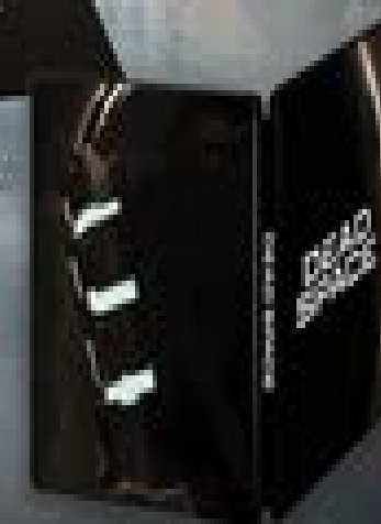
DEAD SPACE THE MOTION PICTURE