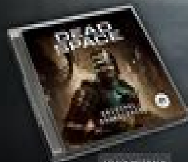
THE MOTION PICTURE