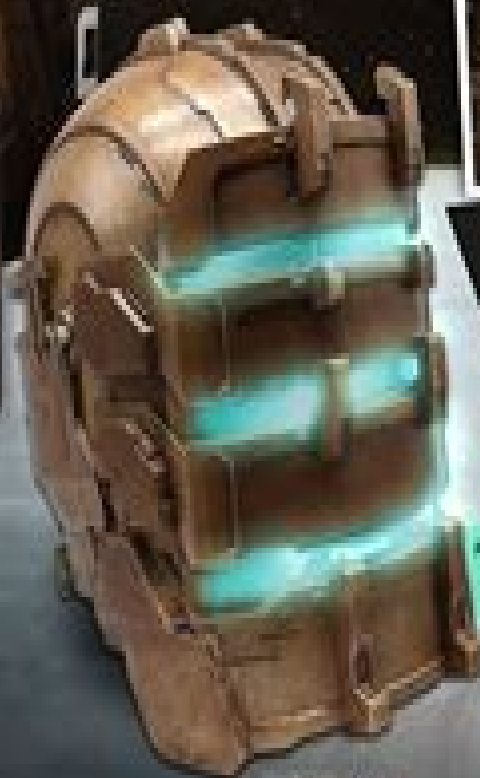
100% POLYMER 1/4" (6.35mm)