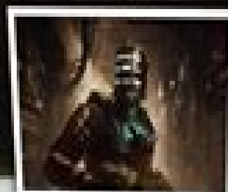
1000-PAGE PHOTO BOOK