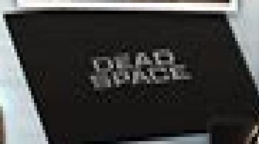
DEAD SPACE THE MOTION PICTURE