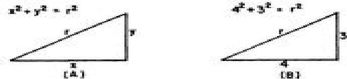
Figure 19-2.—The Pythagorean Theorem.

The rule of Pythagoras, or PYTHAGOREAN THEOREM , states that the square of the length of the hypotenuse (in any right triangle) is equal to the sum of the squares of the lengths of the other two sides. For example, if the sides are