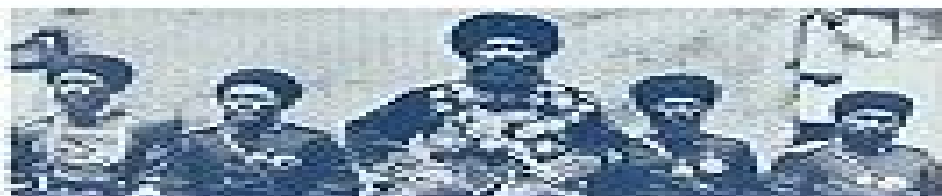
Vitaly V. Naumkin