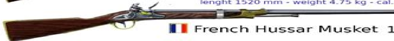
French Hussar Musket 1786

length 1520 mm - weight 4.75 kg - cal. 17.5 mm