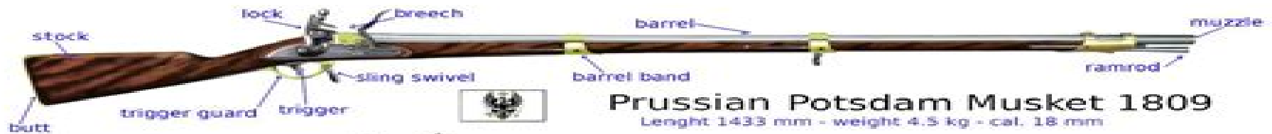
Prussian Potsdam Musket 1809

Length 1433 mm - weight 4.5 kg - cal. 18 mm