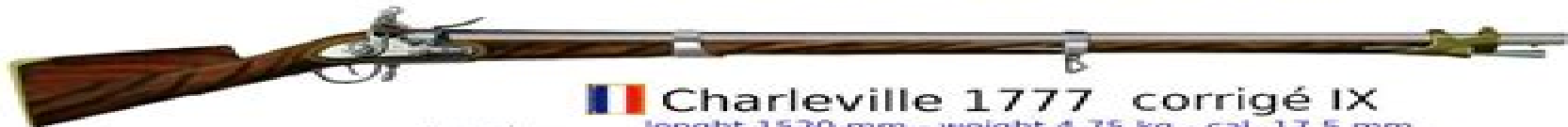
Charleville 1777 corrigé IX

length 1458 mm - weight 5 kg - cal 17.8 mm