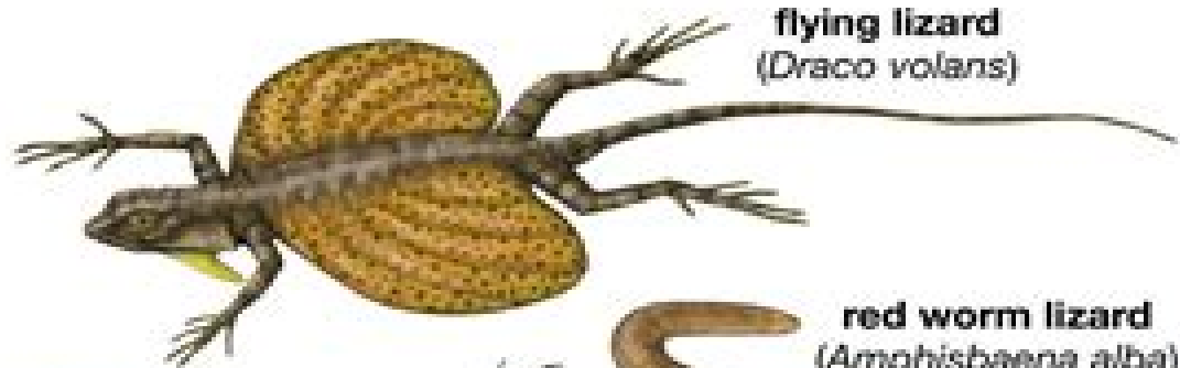
flying lizard ( Draco volans )