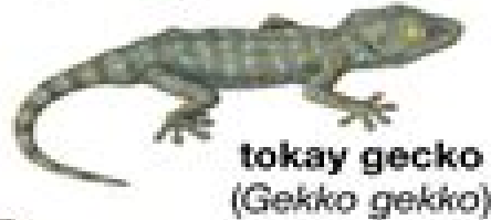
tokay gecko ( Gekko gekko )