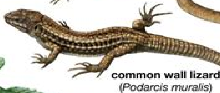
common wall lizard ( Podarcis muralis )