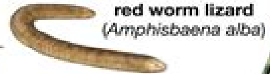
red worm lizard ( Amphisbaena alba )