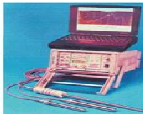
Figure 1: The Scintiprobe digital counter connected to a computer.

threshold level of the probe signal processor was adjusted to eliminate the background sound over normal tissues. The Scintiprobe digital counter was connected to a computer, thus the measurements were