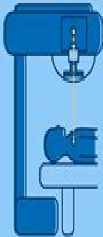
Certain cancer treatments using gamma rays