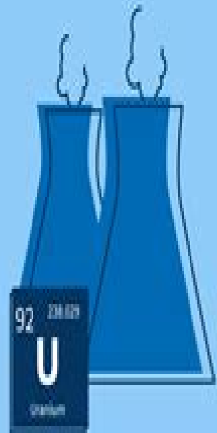
Some of the materials used in nuclear power plants