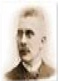
Henry Louis Le Châtelier