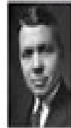
Harold Clayton Urey