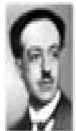
Louis de Broglie