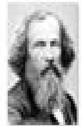
Dmitri Ivanovich Mendeleev