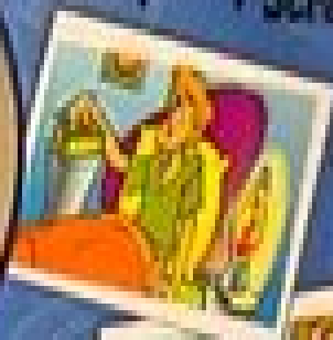
Shaggy and Scooby-Doo