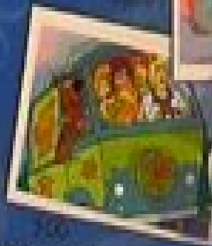
Shaggy and Scooby-Doo