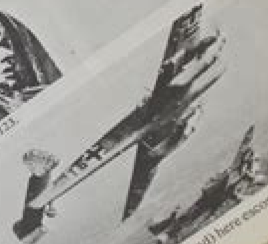
Messerschmitt Bf 110 (in foreground) here escorting a