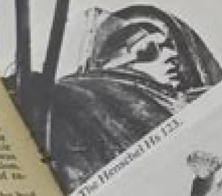
The Heinkel He 112.

In the first years of the war a number of biplane fighters were equipped with the Daimler-Benz 17, originally designed as a "fast bomber."