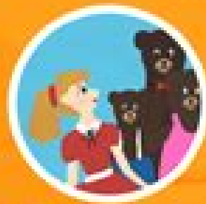
Goldilocks and the Three Bears