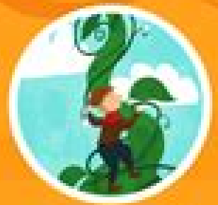
Jack and the Beanstalk