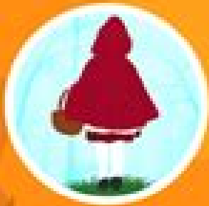
Little Red Riding Hood