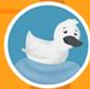
The Ugly Duckling