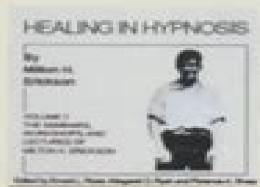
Healing in Hypnosis

Includes 4 Complete Books, Updates & Audio