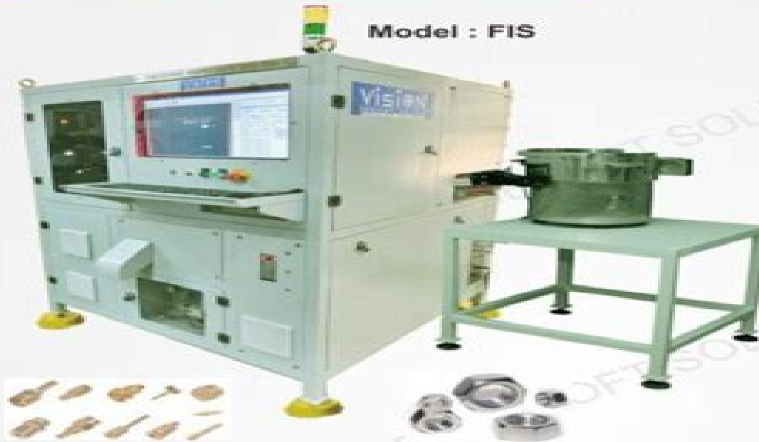
Model : FIS