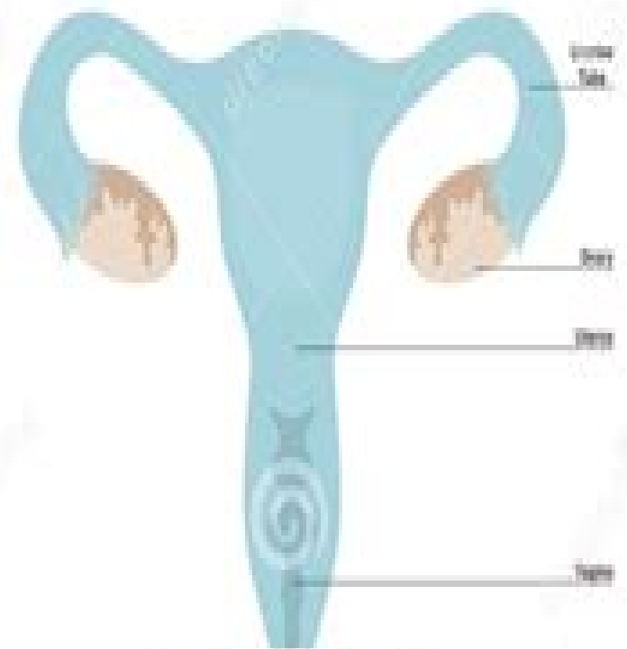
Female Reproductive System