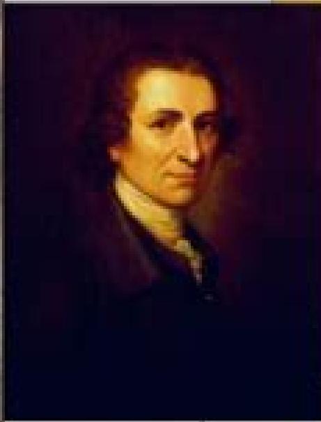
Age of Reason/ Enlightenment