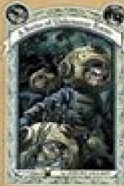
«THE GRIM GASTRO»