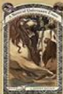
«THE CANNIBAL'S COBERT»