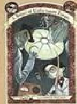
«THE HOSTILE HOSTESS»