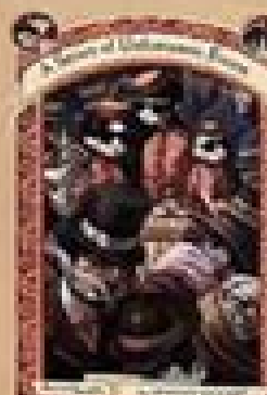
«THE FIDELITY FERIA»