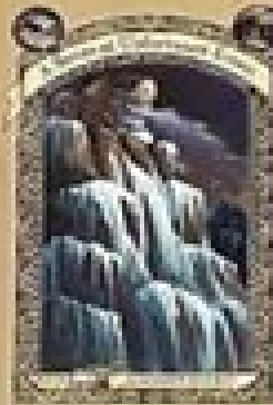
«THE SLIPPERY SLOPE»