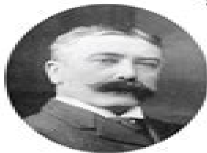
Ferdinand de Saussure (1857-1913)

Semiotics is the study of signs. It is both the theory & analysis of signs & signifying practices.