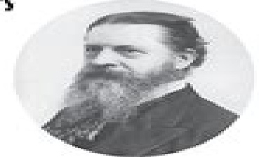
Charles Sanders Peirce (1839-1914)

Charles Sandes Peirce, was an American philosopher that also formulated a semiotic theory around the same time as Saussure, the early 1900's. Pierce stated semiotics to be the relationship between a SYMBOL, ICON and an INDEX.